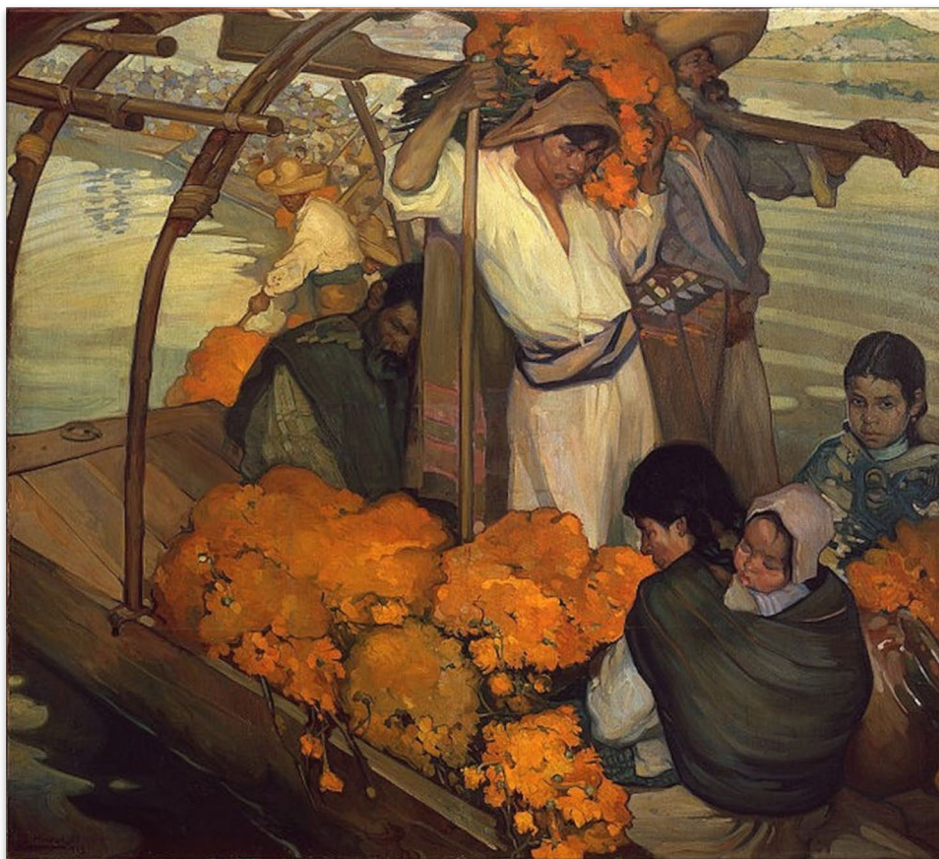
"The Offering," Saturnino Herrán (1913)