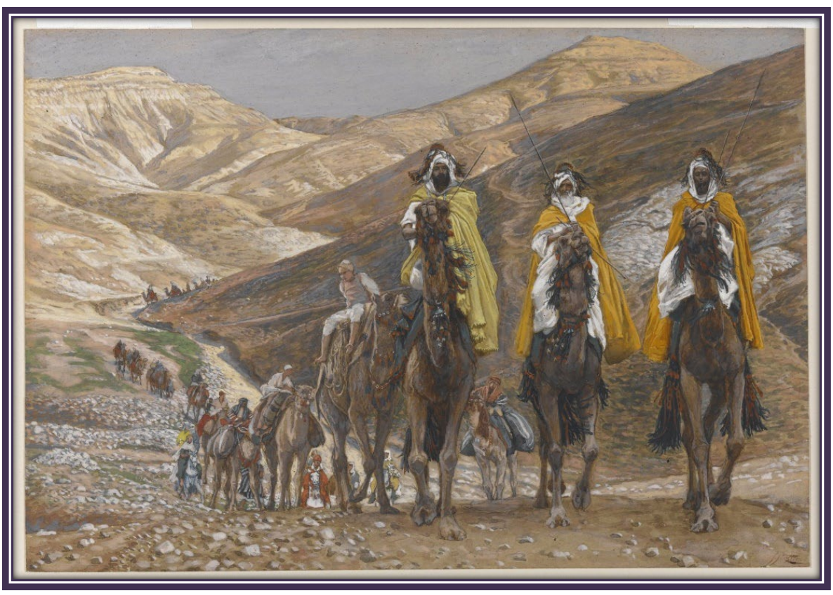
James Tissot, "The Magi Journeying (Les rois mages en voyage)," 1886–1894