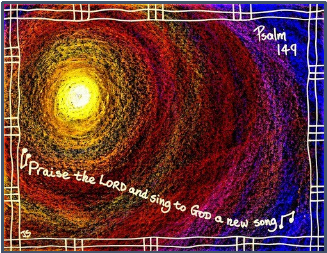
"Praise the LORD and Sing to God a New Song" by Stushie Art