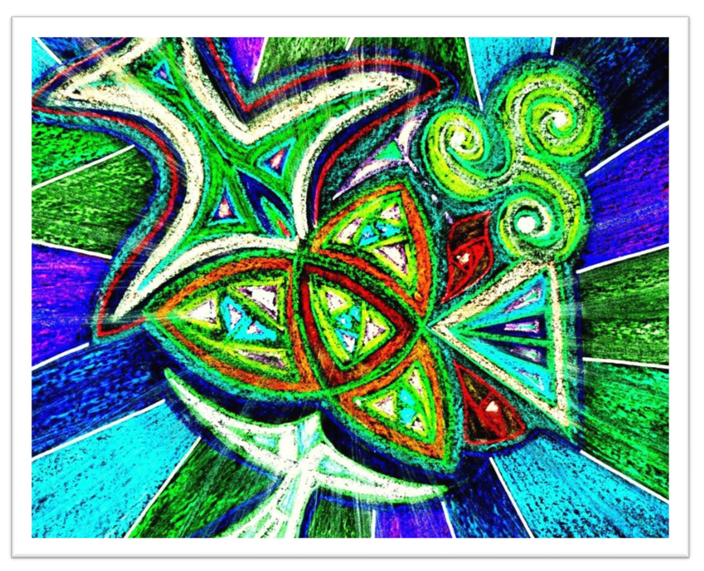
"Triune Heart of the Universe," by Stushie